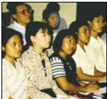
Theology students learn Faith Sharing in Jakarta, Indonesia.

GOAL: To equip more than 100,000 Methodists around the world with the skills and principles of Faith Sharing.