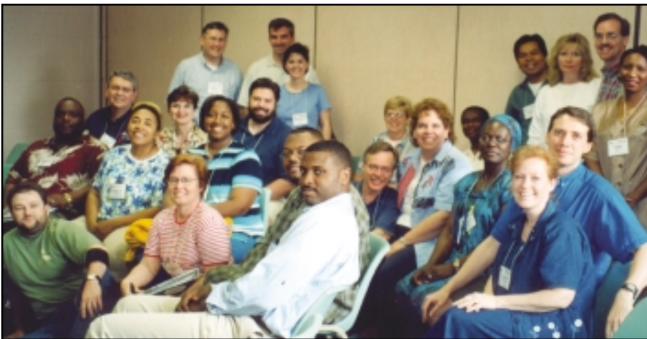
Members of the Order of the FLAME in a mentoring group at the April Renewal Conference at Epworth By The Sea, St. Simons Island, Georgia.

I n April, 2003, 125 young leaders in the Wesleyan/Methodist movement in North America worshipped under the Spanish Oaks where the Wesley's walked 265 years ago. These leaders were experiencing the power and presence of the Holy Spirit at the first Renewal Conference of the Order of the FLAME.