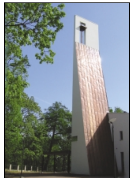
At left, the Connecting Congregation in Hottanza, Bulgaria gathers on the front steps of their church. At right, the new church building in Tartu, Estonia.

four languages: Bulgarian, Armenian, Turkish and Romanian.