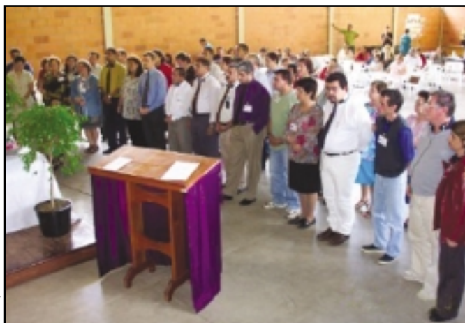
Prayers for 30 missionaries serving in the Missionary Conferences for the Methodist Church in Brazil at the WMEI National Seminar in Brazil.