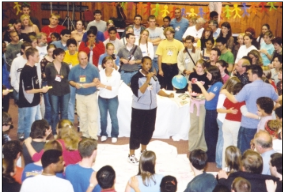
Young people praying for the world at the 7th International Christian Youth Conference on Evangelism at Newtownabbey, Northern Ireland.